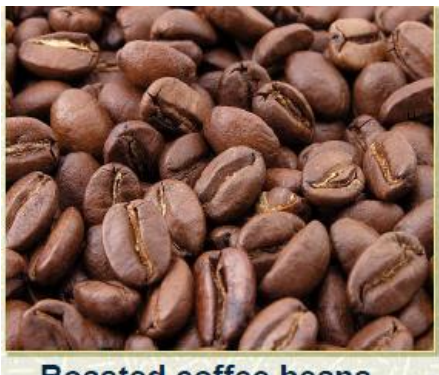
Roasted coffee beans